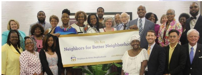
NBN staff at the 2017 "We've Got Roots" Leadership Luncheon

NBN celebrates the assets of local residents by fostering an environment where each individual's gifts, skills, and talents can be leveraged to support and uplift their community. As we enter our 28th year, NBN's staff and board of directors remain committed to fulfilling the important mission and work of this vital organization.